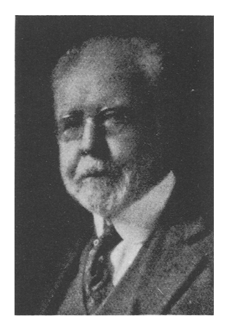
GEORGE P. MERRILL (in 1927).

effectively. The economic collections which he installed are probably the best that are to be seen in any museum. In connexion with this work he wrote a useful book, 'The non-metallic minerals, their occurrence and uses' (1904 and 1910), which was one of the first and best books on economic minerals; also 'Stones for building and decoration' (three editions, 1891, 1897, and 1903), and 'Treatise on rocks, rock-weathering and soils' (1897, 1907). Excellent handbooks