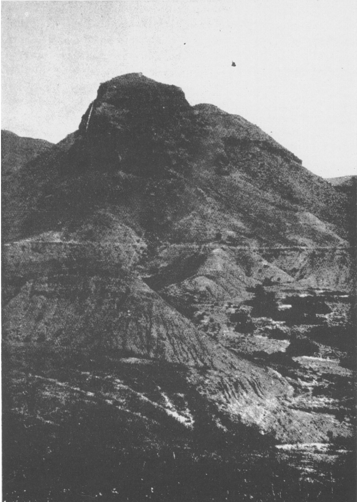
FIG. 2. Western and south-western aspects of Tul-i-Marmar, Persia.

burnt bituminous matter and a dark-brown powdery ash which covers the hill-side give rise to a conspicuous black landmark on the edge