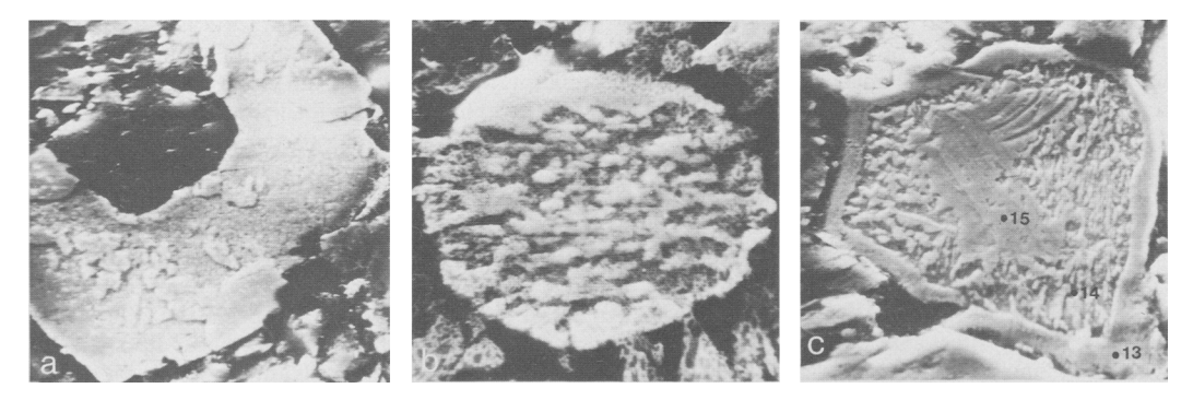
FIG. 3. Electron micrographs. (a) Small metal grain of microspotted plessite (× 750). (b) Small metal grain within a chondrule (× 2300). The grain is essentially taenite in two zones. (c) Small metal particle on a chondrule surface (× 520). The taenite particle comprises three zones: a core of taenite surrounded by micrographic plessite with a taenite rim. Analyses of points 13, 14, and 15 are given in Table I.

2. The particles differ in the structure of their plessite and zoned taenite. Large particles have two types of coarse plessite, acicular plessite possibly derived from martensite, and micrographic plessite, which differ in Ni content. In the small particles plessite may be microstriped, microspotted, micrographic, or more complex in structure. In all