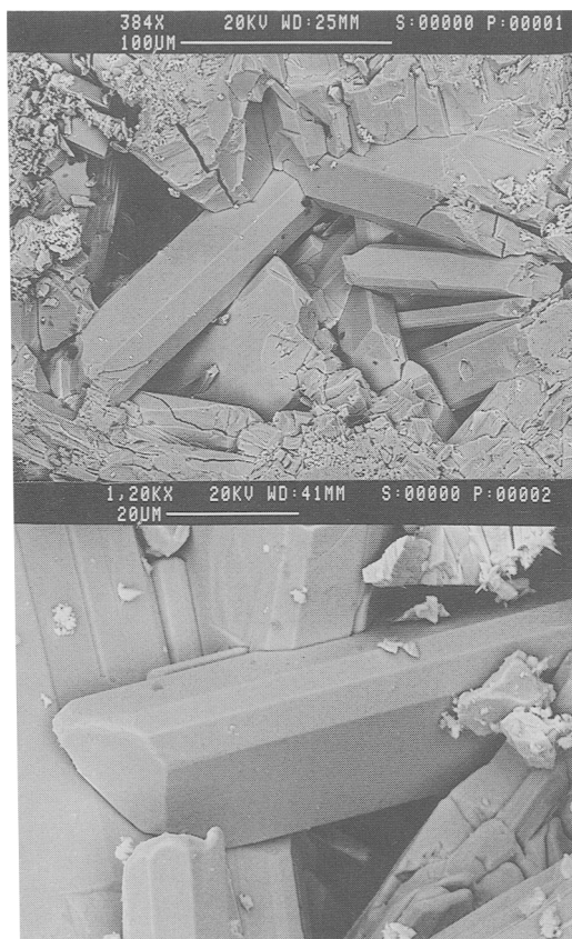
Fig. 1. Scanning electron photomicrographs of intergrown prismatic cannonite crystals (Scale bar: top 100 \mu\text{m} ; bottom 20 \mu\text{m} ).

Electron probe microanalysis was used to determine the chemistry of cannonite, with \text{H}_2\text{O} being determined both by difference and by analogy to the synthetic compound. Initial micro-