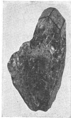
Fig. 3. Cyrtolite mass showing typical radiating structure at base and crude zircon-like crystal at top. Actual size about 1 cm. in longest direction.

Some typical examples of the cyrtolite intergrowth were selected and ground for analysis. A little thucholite was unavoidably present in the sample analyzed but not enough to appreciably affect the results, which are given below: