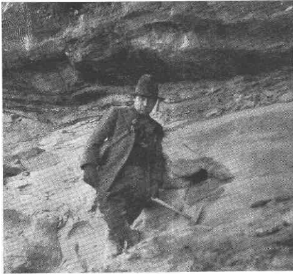
FIG. 2. Black roscoelite halo around a piece of fossil wood (now removed) in Morrison sandstone. East side of Carrizo Mountains, New Mexico.

In places patches of sandstone are irregularly blotched and spotted by black minerals and sometimes impregnated with carno-