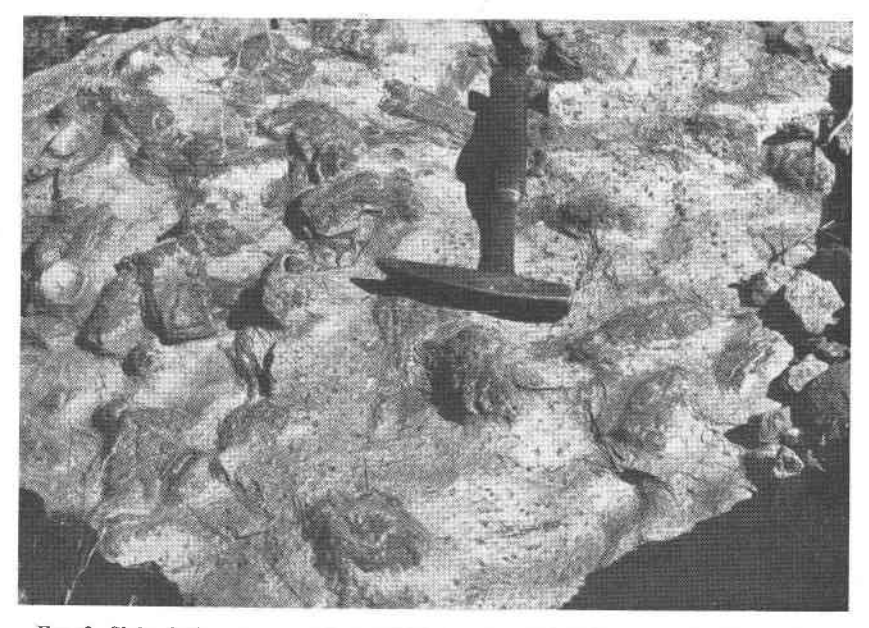
FIG. 3. Slab of silvery gray schist exhibiting two sets of dark gray cordierite porphyroblasts. Those in the smaller set do not exceed \frac{1}{2} inch.