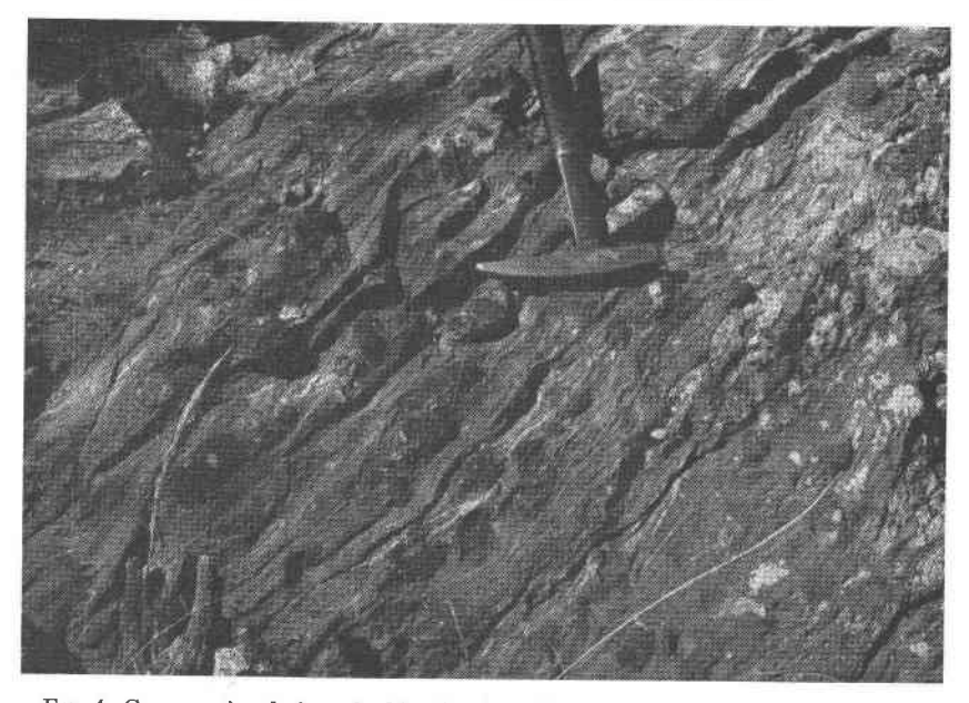
FIG. 4. Cross-sectional view of schist showing relation of porphyroblasts to foliation. Most of these are spheroidal.