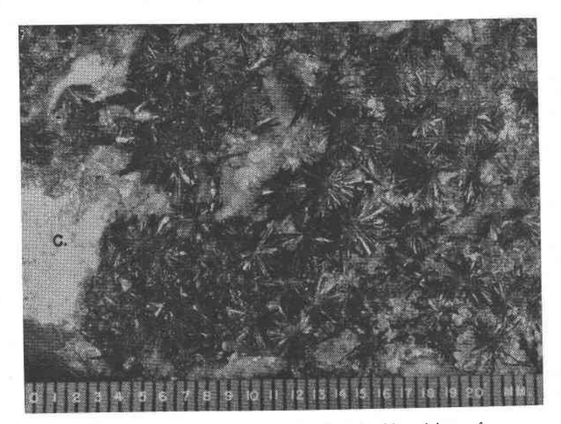
FIG. 1. Santafeite rosettes with associated calcite (c) on joint surface of Todilto limestone.

in diameter. Some of them are triangular in profile along the diameter, suggesting an original spherulitic form from which the upper two-thirds has been broken away. A typical rosette 2.8 mm. in diameter consists of crystals measuring approximately 0.3 mm. along the a -axis, 0.07 mm. along the b -axis, and 1.4 mm. along the c -axis. The small size and fragile character of individual crystals prohibited optical goniometric measurements. Of the forms present, however, the b -face is especially prominent.