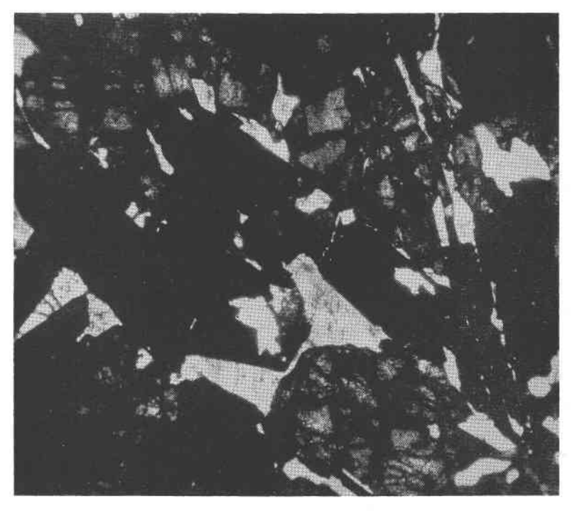
FIG. 2. Plane light, \times 45. Photomicrograph of columbite masses showing the relationship of anhedral fersmite (gray, high relief) to subhedral columbite (black) and interstitial calcite (white).

on the basis of analyses made by the Montana Bureau of Mines and the U. S. Geological Survey. However, the black homogeneous-appearing columbium-bearing masses were described by Sahinen as being "stubby prismatic crystals of columbite as much as two inches across," and no mention was made of the intimately intergrown fersmite.