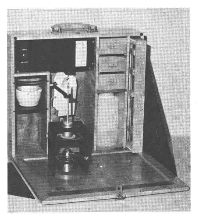
Fig. 1. Photograph of zeolite test kit.

The sample is ground in the mortar to below 14 mesh or 1 mm size. After zeroing the balance with the coin envelope suspended on the hook, 5 gm of ground sample are added into the envelope. The weighed sample is placed in the thin-walled aluminum container and heated to 350°C over the burner with the mounted thermometer inserted midway into the sample (Fig. 1). When this temperature is reached, the sample container is removed with gloves or tongs from the burner, capped, and set aside to cool. For rapid cooling the sample container can be set in water. The cover is removed, and the temperature (T_s) of the sample is measured to within 0.2°C. Ten ml of water at a temperature (T<sub>w</sub>), preferably atmospheric temperature, are poured on the sample and the mixture is stirred quickly with the thermometer. The temperature of the mixture rises rapidly, reaching a maximum value (T_{\text{max}}) within 30 seconds, and then slowly drops to atmospheric temperature. A high temperature rise upon the addition of water is characteristic of the presence of zeolitic material in the sample, and the amount of temperature rise (\Delta T) is directly propor-