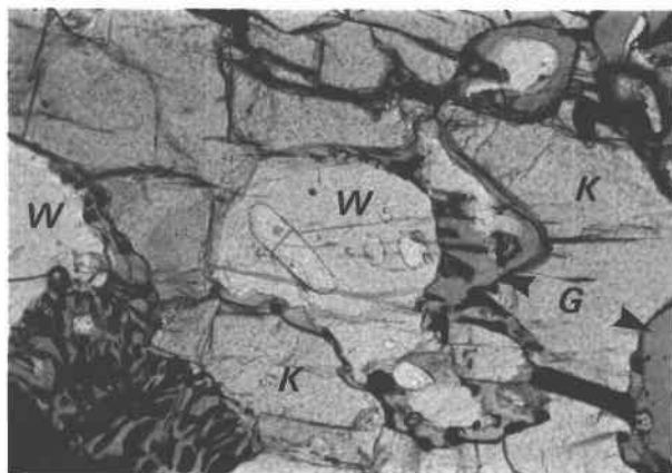
Fig. 2. Kornerupine (K) enclosing werdingite (W) that contains sillimanite inclusions. Replacement of werdingite by grandidierite (G) ( \pm hercynite) occurs at kornerupine-werdingite boundaries. In the bottom left corner, grandidierite-hercynite symplectite replaces werdingite from a hercynite-werdingite boundary. Photo length is 2 mm.