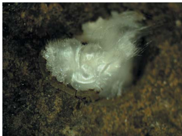
FIGURE 1. Silky mazzite-Na fibers filling a cavity in basalt from the open pit of the U.S. Borax mine at Boron, California. The long dimension of the cavity is 5 mm. The mazzite-Na has grown on a saponite layer about 0.4 mm thick, and small crystals of analcime decorate the fibers on the lefthand side.

Mazzite-Na typically forms sprays of white, satiny fibers, which are so delicate that when the fluid drained from the cavity, the fibers collapsed into lustrous mats (Fig. 1). The fibers are extremely fine, typically about 10 \mu\text{m} wide, but up to 2 mm in length. As shown in Figure 1 analcime is the only other zeolite found to grow on or even in the same cavity with mazzite-Na.