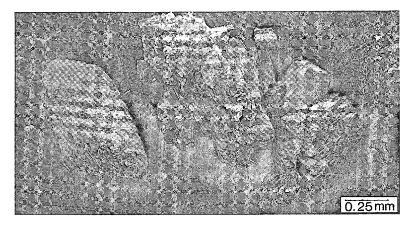
FIG. 1. Possible griceite pseudomorphs displaying pseudotetragonal or pseudomonoclinic morphology.