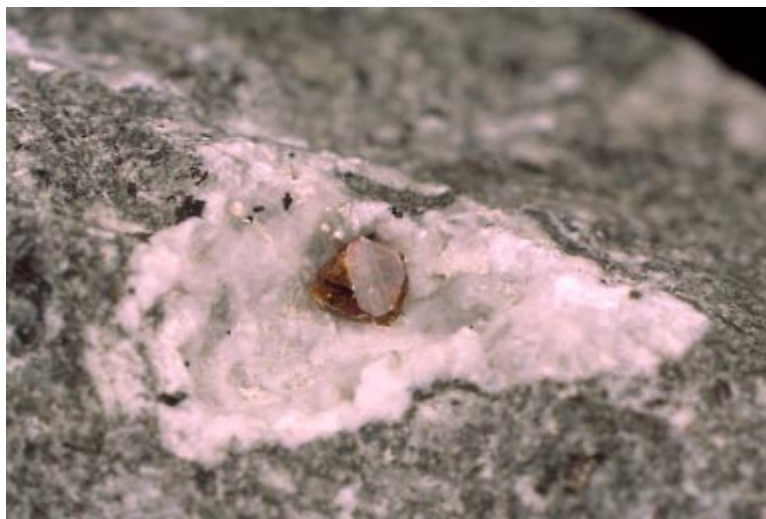
FIG. 1. A crystal of ferrokentbrooksit 1.5 mm in diameter. W. Lane specimen.

birefringence. A Gladstone–Dale calculation gives a compatibility index of 0.001, which is rated as superior (Mandarino 1981).