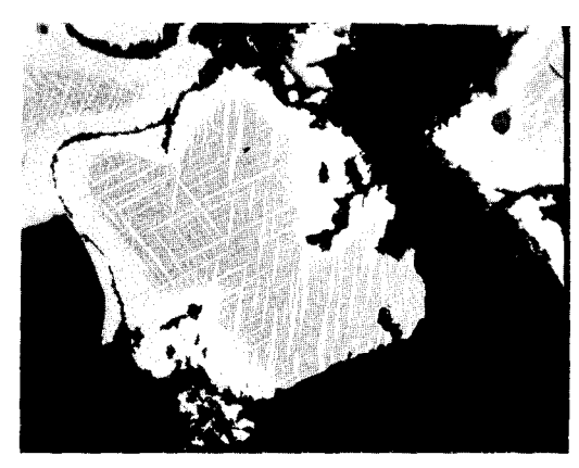
Fig. 1. Isocubanite (medium grey) with lamellae and rim of Fe-Zn-rich chalcopyrite, associated with wurtzite in EPR 21 °N sample. Polished section photograph (× 120).

cubanite by Geijer (1924) and then discredited; a study of the topotype material by the Department of Mineralogy of the British Museum (Natural History) also proved that it was a mixture without isotropic material (M. H. Hey, pers. comm.). Unfortunately, Borchert (1934), observing that cubanite II was a mixture of thin lamellae of chalcopyrite in an isotropic phase close to cubanite, named this material chalcopyrrhotite. This name was later used by Ramdohr (1960) for several occurrences of this phase, although he thought that the choice of the name was unfortunate. In submarine sulphide samples, this mineral has variously been called chalcopyrrhotite, iss, cubic cubanite or even (incorrectly) cubanite.