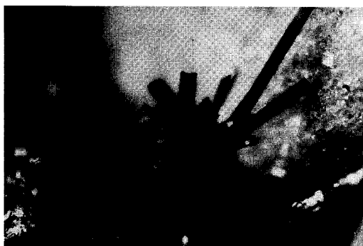
FIG. 3. Type specimen of jentschite with typical gypsum twinned crystal. The largest crystal has a length of 2 mm.

University of Basel) for their help in performing SEM pictures and chemical analyses of the minerals (especially the Sb-bearing edenharterite). The Arbeitsgemeinschaft Lengenbach, the syndicate exploiting the Lengenbach minerals for scientific research, kindly put the required material at our disposal.