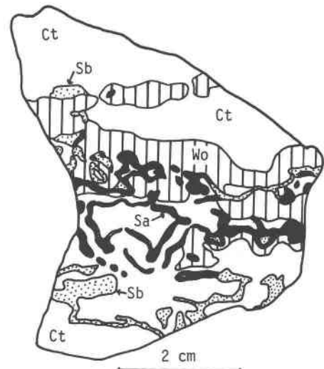
Fig. 2. Sketch of the studied sarabauite-bearing specimen. Sa: sarabauite; Sb: stibnite (with minor senarmontite); Wo: wollastonite; Ct: calcite.

In the sarabauite structure (Nakai et al. , 1977), the