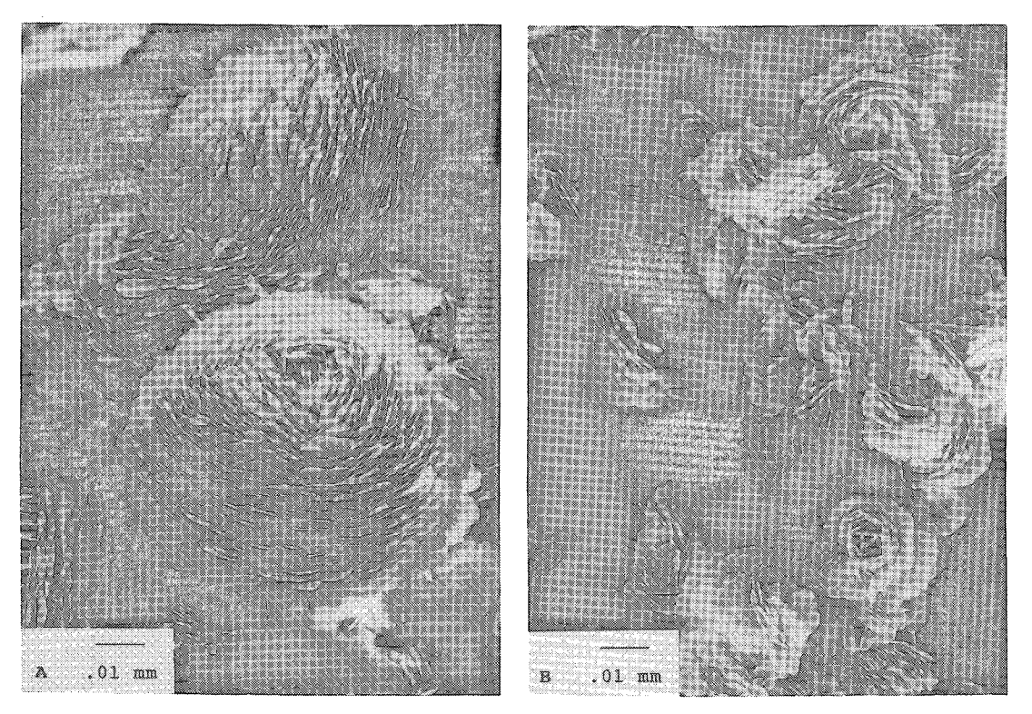
FIG. 1. A and B. Aggregates of bromellite crystals on natrolite, Saga quarry, Porsgrunn, Norway.

zation of nepheline in the Saga pegmatite dyke was briefly discussed by Larsen (1981).