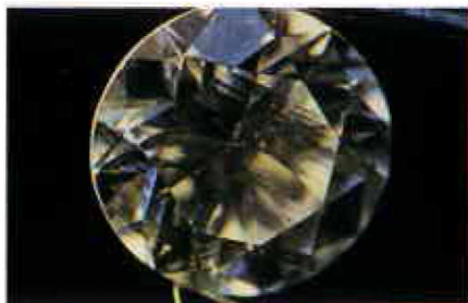
Growth striations in cubic zirconia. Magnification 10x.