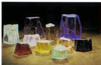
Several colors of skull melt rough cubic zirconia.