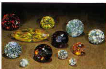
Several colors of faceted cubic zirconia.

apparent. With those familiar with diamond sizes and weights, merely weighing the stone will show its weight to be considerably greater than that of a diamond of the same size. This is sufficient to prove that it is not a diamond. The factors related to refractivity show up in the appearance of the stone, particularly when tilted, and looked at from the side. When one