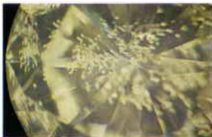
Elongated bubbles partially lined with flux. Magnification 15x.