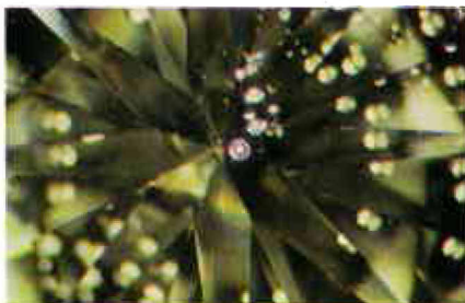
Large gas bubbles like these are rare in cubic zirconia. Magnification 45x.