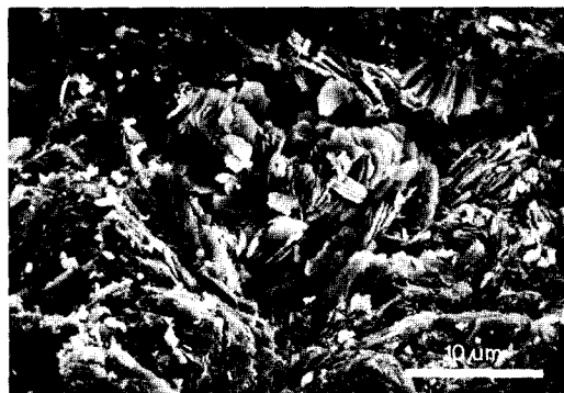
FIG. 1. SEM photograph of hydroxyl-bastnaesite-(Nd).

proximately 30 \mu\text{m} by 40 \mu\text{m} (fig. 1), a small cavity of crystals occurs within what appears to be a more massive body. The outside, apparently massive rim is composed of plates of bastnaesite so tightly intergrown and compacted as to appear massive. The cleavage surfaces and edges of the crystal stacks show, however, that they are built of plates. Within the cavity is a more open cluster of stacks of plates present in several orientations that illustrate the crystal habit and morphology. Many of the plates tend to be elongated. Because a wavelength-dispersive microprobe scan showed all of these crystals to be bastnaesite-(Nd), it is inferred that, despite differences in physical compaction and intergrowth, these are mineralogically the same.