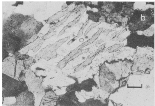
FIG. 1. Photomicrographs of mesoperthite exsolution textures in Scourian granites (crossed nicols). The scale bar is 100 \mu m. (a) mesoperthite in hypersolvus granite, showing fine oriented lamellae of orthoclase in plagioclase; (b) mesoperthite showing broad irregular lamellae of orthoclase in plagioclase; (c) mesoperthite in two-feldspar granite with fine regularly spaced lamellae in the centre of the grain which pass abruptly into coarser irregular lamellae at the edge of the grain.

up to \pm 20 \text{ mol }\% albite about the critical composition will result in a difference of only about 50 °C in solvus temperature. This means that the Scourian mesoperthites probably crystallized within 50 °C of the critical temperature of the ternary feldspar solvus at An<sub>12</sub>.