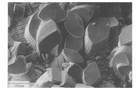
FIG. 1. Short prismatic crystals of compreignacite from West Wheal Owles, St. Just, Cornwall, showing elliptical profile and basal fracturing.

variably developed modifying pyramidal faces (Fig. 2; cf. figure 1 of Protas, 1964). These crystals are often intergrown in small groups.