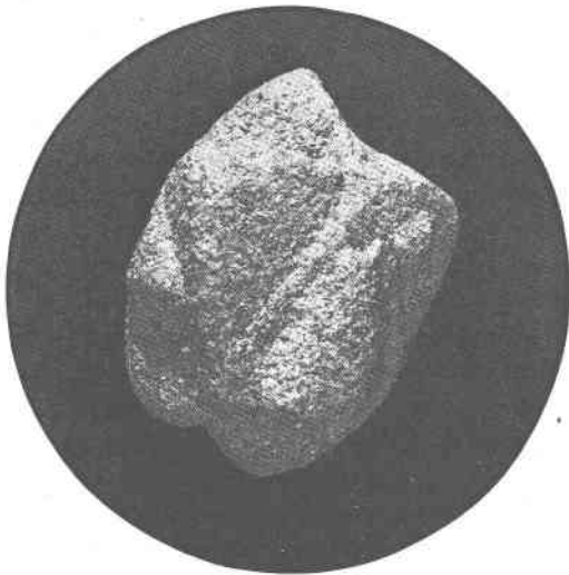
Fig. 1. Sand-Calcite Twin-Crystal from Cholame Hills, Monterey Co., California.

In the Wyoming locality Barbour notes the same transition "from the solitary crystals to the concretions, compound concretions or pipes, to the compound pipes and solid rock," but says