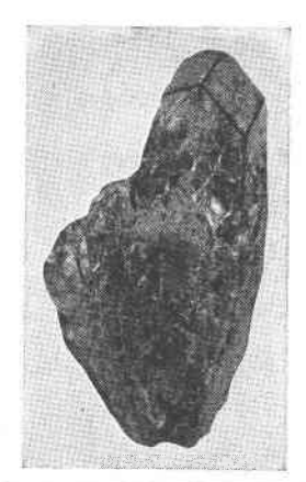
Fig. 3. Cyrtolite mass showing typical radiating structure at base and crude zircon-like crystal at top. Actual size about 1 cm. in longest direction.

Some typical examples of the cyrtolite intergrowth were selected and ground for analysis. A little thucholite was unavoidably present in the sample analyzed but not enough to appreciably affect the results, which are given below: