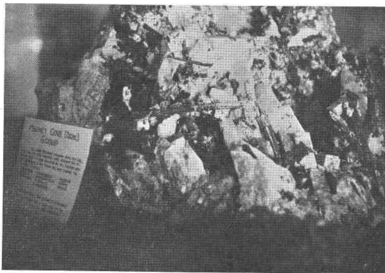
FIG. 2. View of case in Alabama Museum of Natural History. The specimen contains 10 minerals and weighs about 400 lbs. The black crystals are acmite, the white is feldspar.

Going east on the highway one will pass an old church on the left side of the road about \frac{1}{2} mile from Cove Creek Bridge. In front of this church there is a small