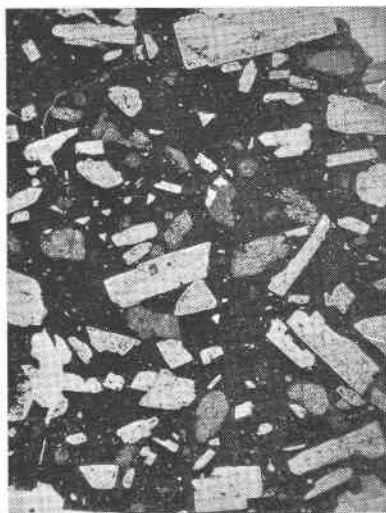
FIG. 1. Thin section of latite about 2 miles east of Vallecito, Big Trees Quadrangle, California. This section served for part of the measurements used in figures 2, 7 and 8. \times 24 .

The rock differs little from place to place, a fact also attested by earlier observers. The feldspar phenocrysts vary greatly in size, a few attaining maximum dimensions of half an inch or more. They are mostly euhedral tabular to (010). Other prominent forms are (001), (110) and ( 1\bar{1}0 ). All crystals show many times repeated