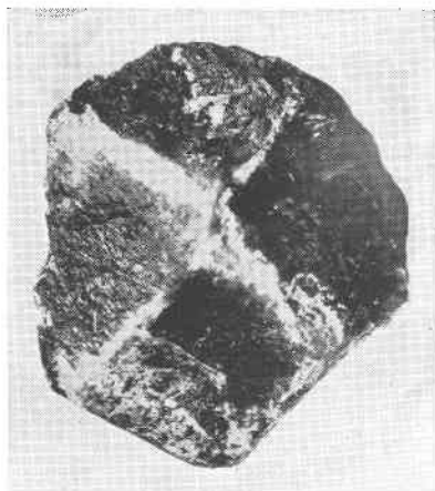
FIG. 1. Uraninite crystal, Pied des Monts, Quebec. (Natural size.)