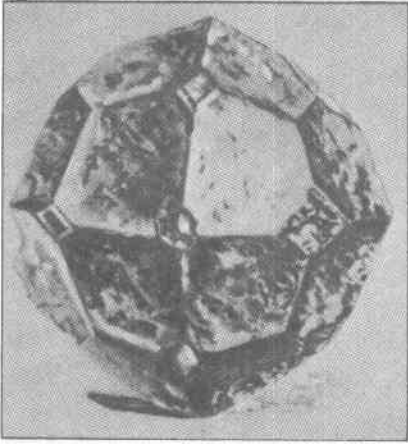
Fig 1 KUNZ COLLECTION (4)