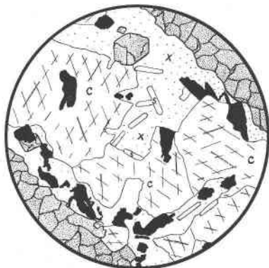
FIG. 2 Vein in zone of light silicates: garnet (stippled), calcite (c) and pyrrhotite (black) with ?xonotlite (x) enclosing laths of scawtite (s). \times 27 .

Table 2 gives the observed mineral sequence in this zone. With the exception of the oxides and sulphides of iron the minerals of this zone are almost exclusively aluminosilicates of calcium with only minor amounts of magnesium, iron, potash, etc. Again one can only speculate as to the amount of material introduced by