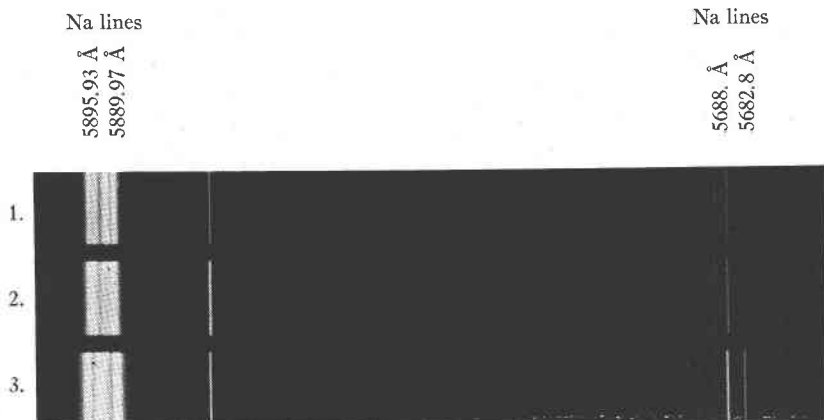
FIG. 1. Spectrograms of (1) schroeckingerite, (2) synthetic mixture of U_3O_8 and CaCO_3 containing 3.6 per cent Na_2O and (3) the synthetic mixture with 7.3 per cent Na_2O .

Figure 2 shows the CaF band, with its head at 5291 Å for schroeckingerite and the two standard samples containing 2.0 per cent and 5.0 per