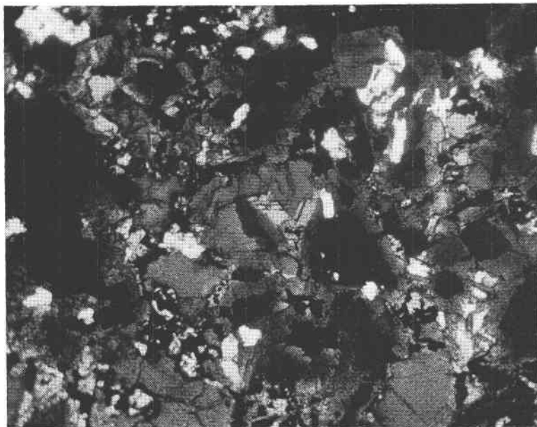
FIG. 3. Photomicrograph of North Carolina emery showing hoegbomite. V-shaped mineral in center is hoegbomite A passing marginally into hoegbomite B (dark rim). Prismatic hoegbomite B in upper right. Corundum (white), magnetite (black, opaque). The rest of section is made up of spinel (example lower right and lower left) and hoegbomite (example top center, right margin). \times 34 .

The North Carolina emery is very similar in composition to the New York and Virginia emery. Its chief mineral constituents are corundum, spinel (of composition near pleonaste), and titaniferous magnetite. Hoegbomite is common. Because of the deep weathering it was not possible to establish with certainty the nature of the rock in which the emery occurs. Outcrops of Roan gneiss, which in this area is of dioritic composition, were noted near emery occurrences.