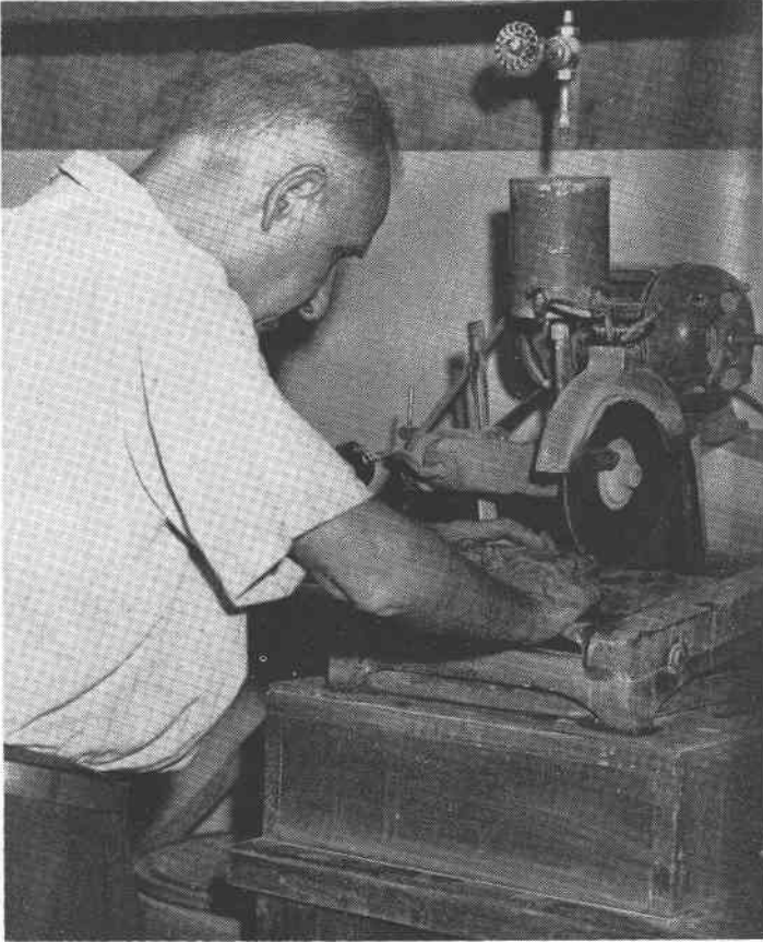
FIG. 2. Use of diamond saw.

driven by a \frac{1}{2} -hp motor at a speed of 1425 to 1475 rpm. Water or kerosene can be used as a lubricant. In the Survey laboratory, a soapy-water solution has been found to be a very satisfactory lubricant for sawing. Use of the diamond saw is illustrated in Figure 2.