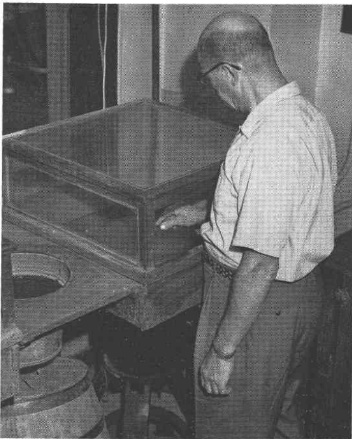
FIG. 1. Grinding unit with horizontal steel lap.