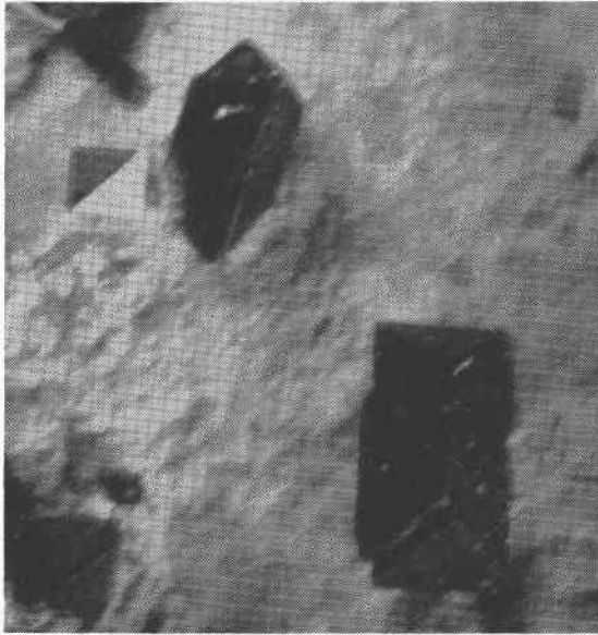
FIG. 1. Chinoite crystals on altered quartz monzonite rock. \times 50 .

When it became apparent, from preliminary studies, that we were dealing with a new mineral, Mr. Baltosser generously donated specimens from his private collection in order that a complete study could be made.