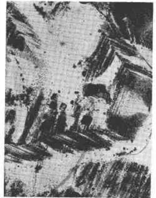
FIG. 2. Photomicrograph of hopper crystals outlined by oriented liquid inclusions. ( \times 18 )