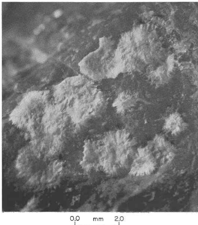
FIG. 2. Photograph of hand sample showing flattened rosettes of white, silky rhodesite on silicic volcanic rock.

of three chemical analyses of the Kimberley material reported by Mountain (1957) and Gard and Taylor (1957). This new analysis was made on 1.5 grams of material that had been hand picked from crusts and then scrubbed in an ultrasonic bath. The composition of the Trinity County rhodesite is similar to that of the Kimberley material although there are some obvious differences. Contents of \text{SiO}_2 and \text{MgO} are higher but \text{Na}_2\text{O} is lower for the Trinity County rhodesite. Total \text{H}_2\text{O} , however, is remarkably similar for rhodesite from both localities.