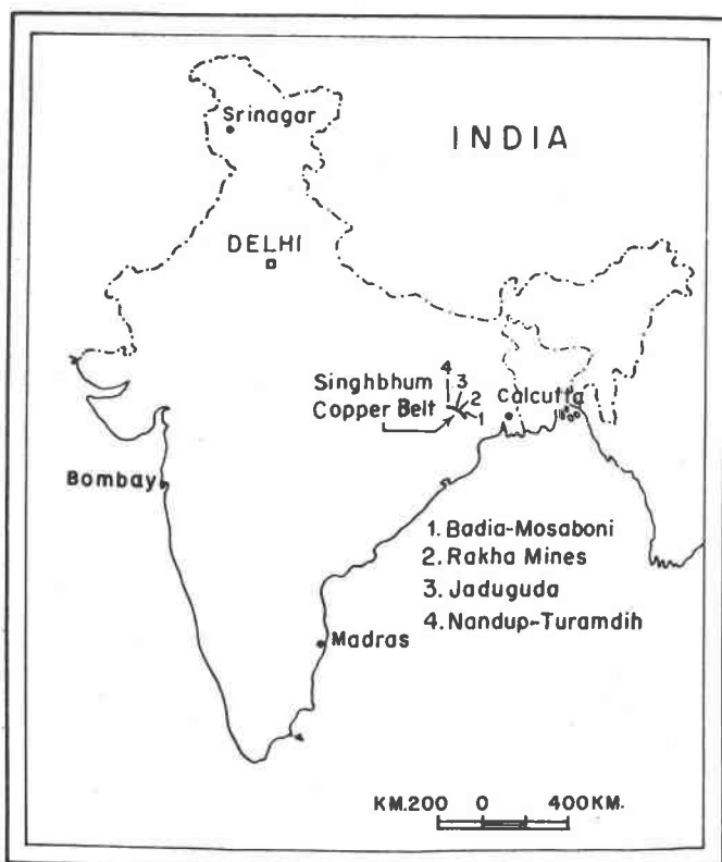
FIG. 1. Sketch map showing the location of the Singhbhum Copper Belt, and of the deposits referred to in the text.

pinkish variety, which corresponds to normal mackinawite as described by previous authors, takes a good polish, and is intensely bireflectant in air, from a grayish-pink to pinkish-gray. The reflectance of this mineral varies over a wide range. Photo-cell measurement using a domestic carborundum standard and a Leitz green filter (absorption peak at 530 nm), gave a range of 19-41 \pm 0.5 percent. The dispersion coefficient, \Delta R , has been found to attain a maximum at 560–600 nm, by measurement with a photometer ocular of the Valinskii type. The mineral is consistently softer than pyrrhotite but, in most orientations, harder than chalcopyrite. This observation is in apparent conflict with those of Kouvo et al. , (1963), as well as of Chamberlain and Delabio (1965). The former workers record a polishing hardness for mackinawite greater than that of pyrrhotite, while the latter consider it to be even softer than galena. In a discussion of the properties of mackinawite from the Ylöjärvi copper-