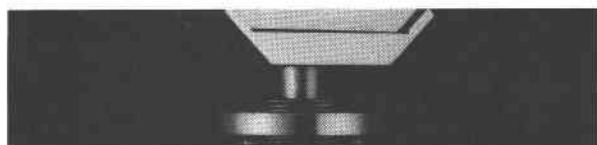
Fig. 3. Revised goniometer head and mounting assembly for miniature diamond cell.

All accessible reflections with l \geq 0 and 2\theta \leq 90^\circ