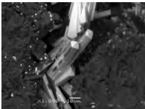
FIGURE 1. Scanning electron microscope (SEM) image (BSE) of demicheleite-(Cl).

Chemical analyses were carried out by means of a JEOL JXA 8200 electron microprobe (WDS mode, 15 kV, 5 \times 10^{-9} \text{ A} , 10 \mu\text{m} beam diameter). The mean analytical results are reported in Table