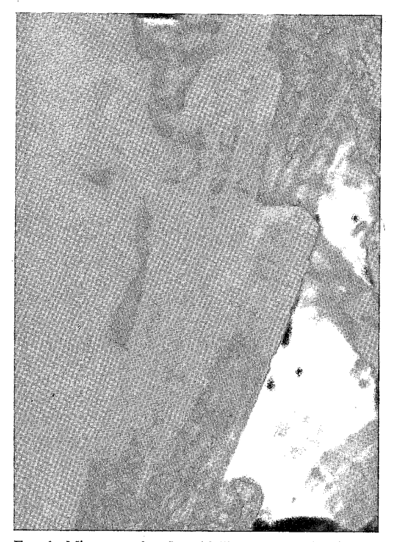
FIG. 1. Microcrystals of weddellite showing {010} and {011}. Length of larger crystal about 5 mm. ROM specimen M38916.

The weddellite crystals from the Weddell Sea were reported by Bannister & Hey (1936) to display only the tetragonal bipyramid {011}. Prien & Frondel (1947) observed no additional forms among several hundred urinary calculi. The Biggs weddellite crystals, however, are primarily prismatic in habit