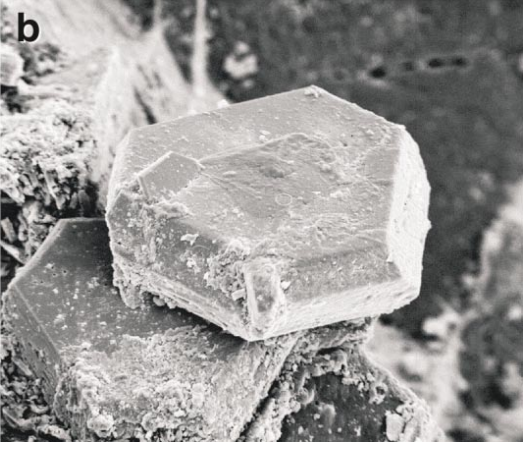
Fig. 1. a. Orange aggregates of cerite-(La) (approximately 3.5 cm across). b. SEM photomicrograph of a rhombohedral crystal of cerite-(La).