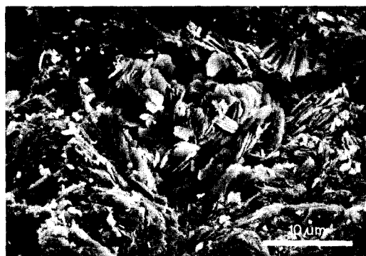
FIG. 1. SEM photograph of hydroxyl-bastnaesite-(Nd).

proximately 30 \mu\text{m} by 40 \mu\text{m} (fig. 1), a small cavity of crystals occurs within what appears to be a more massive body. The outside, apparently massive rim is composed of plates of bastnaesite so tightly intergrown and compacted as to appear massive. The cleavage surfaces and edges of the crystal stacks show, however, that they are built of plates. Within the cavity is a more open cluster of stacks of plates present in several orientations that illustrate the crystal habit and morphology. Many of the plates tend to be elongated. Because a wavelength-dispersive microprobe scan showed all of these crystals to be bastnaesite-(Nd), it is inferred that, despite differences in physical compaction and intergrowth, these are mineralogically the same.