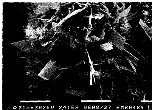
FIG. 1. Scanning electron photomicrograph of a tuft of coquandite crystals from Pereta.

Coquandite crystals from Pereta occur as tiny transparent to translucent colourless individuals, elongated along [001] and flattened on (010); they do not exceed 0.01 mm in thickness, have an adamantine lustre, and a white streak. They are flexible and often display an onion-skin aspect (Fig. 1). The forms observed with a two-circle goniometer are {010} major and {001}, \{2\bar{1}0\} ,