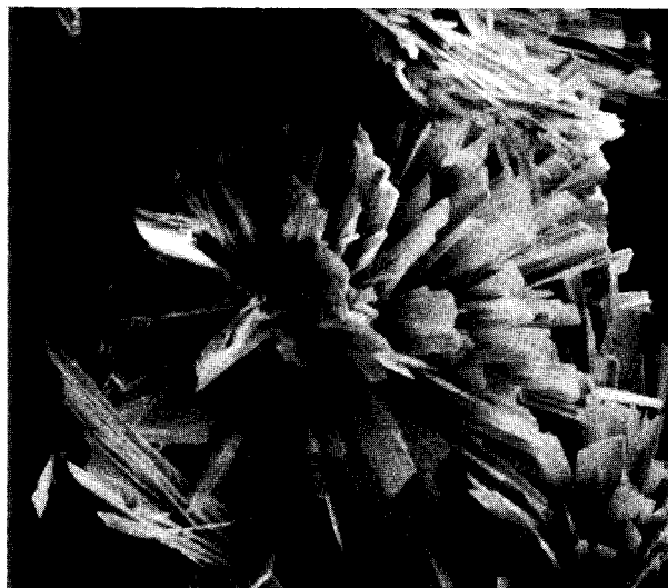
Fig. 2. Scanning electron photomicrograph of tufts of campigliaite. Crystals are about 0.2 mm long.

Preliminary qualitative analyses of campigliaite, made with an ORTEC X-ray microanalyzer, revealed the presence of Cu, Mn, Zn, S and no other element with atomic number greater than 11. Many quantitative analyses were carried out by means of an ARL SEMQ electron microprobe using chalcopyrite, sphalerite and hortonolite as standards. It is important to note that these analyses were done under unfavorable conditions, since campigliaite crystals are very tiny and decompose under the electron beam. The average values of the three best analyses, MnO 9.95, CuO 40.60, ZnO 4.47, SO 3 20.15, H 2 O 24.83% (by difference), correspond to