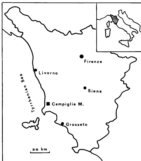
Fig. 1. Location map of the Campiglia Marittima mine, Tuscany, Italy.

tufted aggregates of tiny lath-like crystals (Fig. 2) of a pale blue color, associated with gypsum and sometimes with small amounts of brochantite and antlerite. Often campigliaite and gypsum are closely mixed; however campigliaite appears grown on gypsum crystals (Fig. 3). The genesis of campigliaite is probably related to the sulfate solutions formed by the oxidation of pyrite and other sulfide minerals. The presence of manganese in campigliaite is related to ilvaite. According to Rodolico (1931) ilvaite from Campiglia has 9.5% MnO which is a very high content for this mineral.