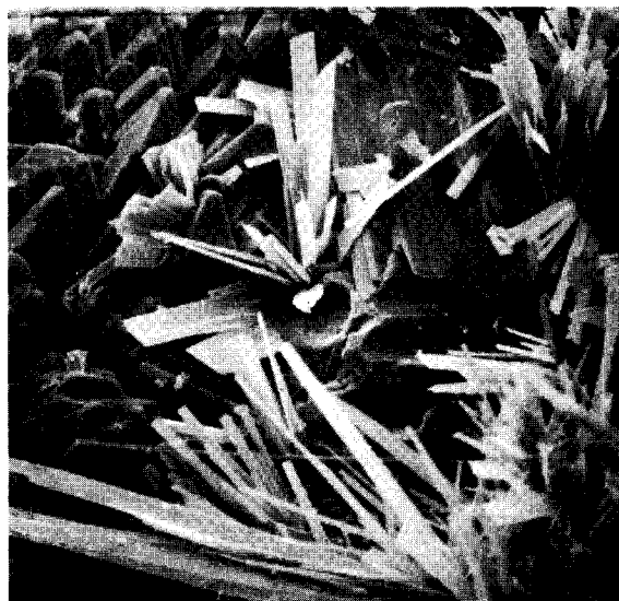
Fig. 3 Scanning electron photomicrograph of crystals of campigliaite grown on gypsum. Crystals are about 0.2 mm long.

A wet chemical analysis, attempted on a small amount of purified material (less than 1 mg) confirmed the previous results for Mn, Cu and Zn (atomic absorption spectrometry). Unfortunately the scarceness of available material did not allow us to obtain reliable results for the SO 4 content. A TGA analysis, performed in order to obtain the H 2 O content, was also unsuccessful.