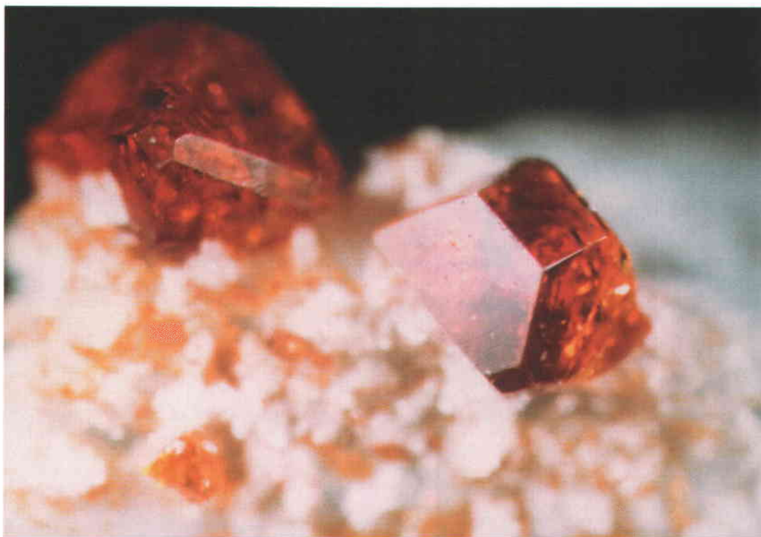
FIG. 1. Manganokhomyakovite crystals (0.5–1 mm).

Khomyakovite and manganokhomyakovite occur as orange to orange-red, transparent to translucent, pseudo-octahedral crystals (Fig. 1) ranging in size from 0.5 mm (khomyakovite) to 5 mm (manganokhomyakovite). For manganokhomyakovite, forms measured by reflecting goniometer include \{0001\} , \{11\bar{2}0\} , \{02\bar{2}1\} , \{10\bar{1}1\} and \{01\bar{1}2\} (Fig. 2). They have a white streak and vitreous luster. Both are brittle, with no cleavage, no parting and an uneven fracture. The minerals have a Mohs hardness of 5–6, and do not fluoresce in either short- or long-wave ultraviolet light. The density of manganokhomyakovite, measured by suspension in methylene iodide, is 3.13(3) g/cm 3 , which compares well with the calculated density of 3.17 g/cm 3 . The density of