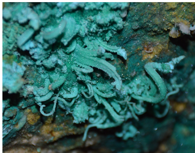
Fig. 2. Anthodites formed by both katerinopoulosite and nickelbousingaultite in situ . Field width 8.5 cm. Only online version in colour.

The new mineral is optically biaxial (+), with \alpha = 1.492(2) , \beta = 1.496(2) , \gamma = 1.502(2) (589 nm); 2V (meas.) = 80(5)^\circ , 2V (calc.) = 79^\circ . Dispersion of optical axes is weak, r < v . Under the polarizing microscope, katerinopoulosite is colourless and nonpleochroic.