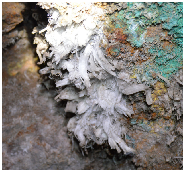
Fig. 1. Anthodites of katerinopoulosite in situ . Field width 10 cm. Only online version in colour.

Katerinopoulosite is brittle. It has Mohs hardness of 2\frac{1}{2} and an uneven fracture. Neither cleavage nor parting is observed. The new mineral is colourless, pale blue, or pale green and has vitreous lustre. Small fragments are transparent. The streak is white. The density measured by flotation in heavy liquids (diiodomethane–ether mixtures) is 1.97(2) \text{ g/cm}^3 . Densities of the liquids have been measured using a density bottle. Density calculated using the empirical formula is 1.986 \text{ g/cm}^3 . Katerinopoulosite is non-fluorescent under short- and long-wave UV light.