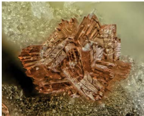
FIG. 1. Intergrown magnesiocanutite crystals. Field of View = 0.45 mm.

3 m deep, a lower pit ~100 m from the upper pit and measuring ~5 m long and 3 m deep, and a mine shaft adjacent to the lower pit and lower on the hill. Magnesiocanutite was found in the upper pit and in the area of the mine shaft by a collecting party consisting of three of the authors (ARK, MD and AAMD) along with Jochen Schlüter and Joe Marty in February 2014.