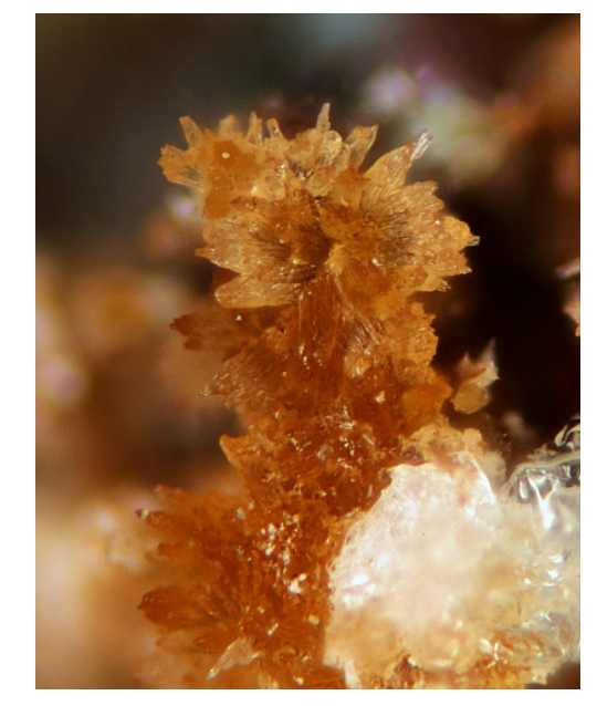
Fig. 1 Aggregate of slightly split, spindel-like möhnite crystals on salammoniac. Field width 0.4 mm.

Powdered sample of the mineral was mixed with KBr, pelletized, and analyzed using an ALPHA FTIR spectrometer