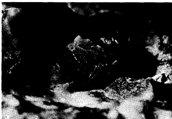
Fig. 2. Bario-orthojoaquinite from the Benitoite Gem Mine, San Benito, California. The crystal displays the typical striated and curved bipyramid faces, and is embedded in massive natrolite. Height of exposed crystal is 7 mm.

(\text{Ba}_{2.88}\text{Sr}_{0.88}\text{Ca}_{0.08}\text{Al}_{0.19})\text{O}_4[\text{Si}_4\text{O}_{12}]_4 \cdot 2.0\text{H}_2\text{O} . A general formula for bario-orthojoaquinite can be written as \text{Fe}_4^{2+}\text{Ba}_4\text{Ti}_4(\text{Ba},\text{Sr})_4\text{O}_4[\text{Si}_4\text{O}_{12}]_4 \cdot 2\text{H}_2\text{O} , ( Z = 2 ).