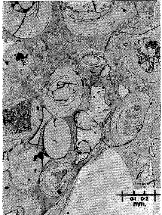
FIG. 1. Polished section of a sample from the Peace River iron deposit. Shown are concentric nontronite layers in ooliths (med. grey), and the ferruginous opal matrix. The white areas are goethite, and the well-polished grey grains are quartz.

A Peace River nontronite concentrate that was treated with Na-dithionite was studied by transmission electron microscopy to further define the degree of structural ordering. It was found that part of one grain (< 25 microns in diameter) was single-crystal nontronite; parts of 6 grains, a few hundred angstroms or less in diameter, were polycrystalline nontronite; 18 grains were amorphous, and 4 were designated as highly faulted. Table 1 shows that nearly all the nontronite diffraction patterns obtained by transmission electron diffraction had spots for the main nontronite d -values of 4.50, 1.51, and 2.61Å, as well as for other lines that are consistent with reported nontronite X-ray powder diffraction patterns (Mikheev 1957; Isophording 1975). The electron diffraction patterns were measured as described by Laufer et al. (1975) and by Jubb & Laufer (1976). The highly faulted grains are characterized by spots that remain visible while the crystal is tilted, but the spots move to give the impression that the pattern is being distorted. Such diffraction patterns result from crystals that consist of platelets only one or two atomic layers thick, or that have stacking faults with similar spacings. Flaky minerals that