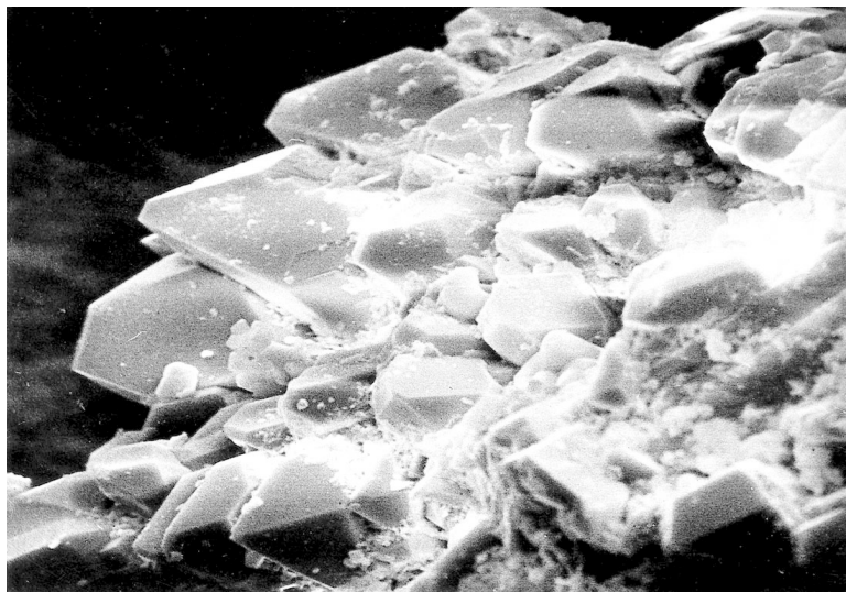
Fig. 1. SEM image of the aggregates of bradaczekite crystals. Magnification: ~ 600×.

The GFTE is the largest basaltic eruption in more than 200 years (Fedotov 1984). It was active in 1975–1976 and consisted of two Breaches (North and South) and seven cones. Beginning in the late 1970s, fumarolic activity of the GFTE resulted in a unique assemblage of minerals, with two dozen new species discovered to date. Bradaczekite was found in 1980, 1983 and 1990 among the products of fumarolic activity on the second cinder cone of the North Breach. The mineral is found closely associated with hematite, tenorite, lammerite, urusovite, orthoclase and johillerite. Exhalative lammerite, Cu 3 (AsO 4 ) 2 , was detected in GFTE fumaroles by Filatov et al. (1984) and Popova & Popov